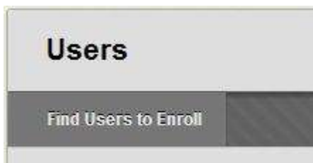
Figure 2: The Find Users to Enroll Button.